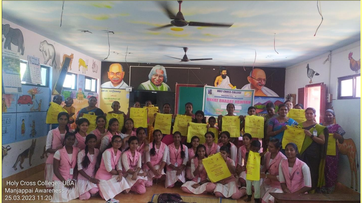
Holy Cross College - UBA Manjappai Awareness 25.03.2023 11:20